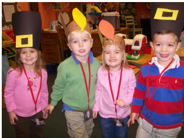
Our little Native Americans & Pilgrims